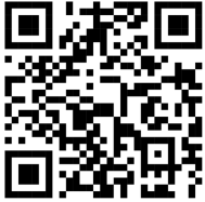
PTTC Virtual Booth QR Code