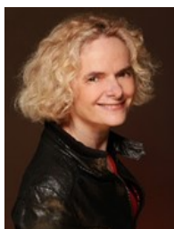
Dr. Nora Volkow, Director - National Institute of Drug Abuse